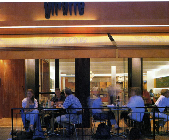
The interior spills out onto the south facing terrace – a welcome addition which is fully exploited with full-height fold-back doors.

TIME WAS WHEN NOODLES CAME OUT OF A tin, covered in tomato sauce. Now they are found in spaces so cool they are called 'bars'. Architect Stiff + Trevillion is perhaps guilty of initiating this trend: the practice designed a noodle bar for Wagamama in 1991, which inspired many subsequent informal restaurants.