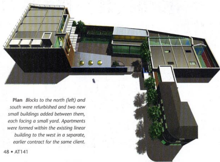
Plan Blocks to the north (left) and south were refurbished and two new small buildings added between them, each facing a small yard. Apartments were formed within the existing linear building to the west in a separate, earlier contract for the same client.